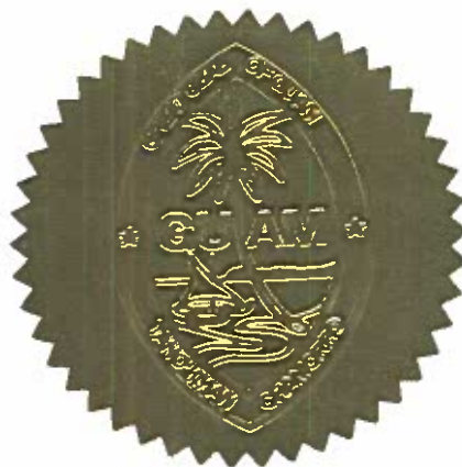
JOSHUA F. TENORIO Sigundo Maga'låhen Guåhan Lieutenant Governor of Guam